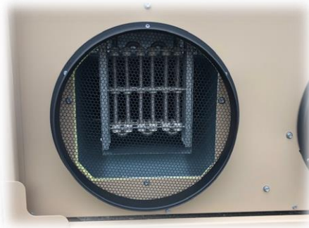
10KW Resistance Heater Kit