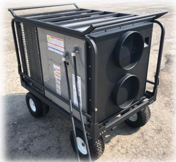
All Terrain Cart Option